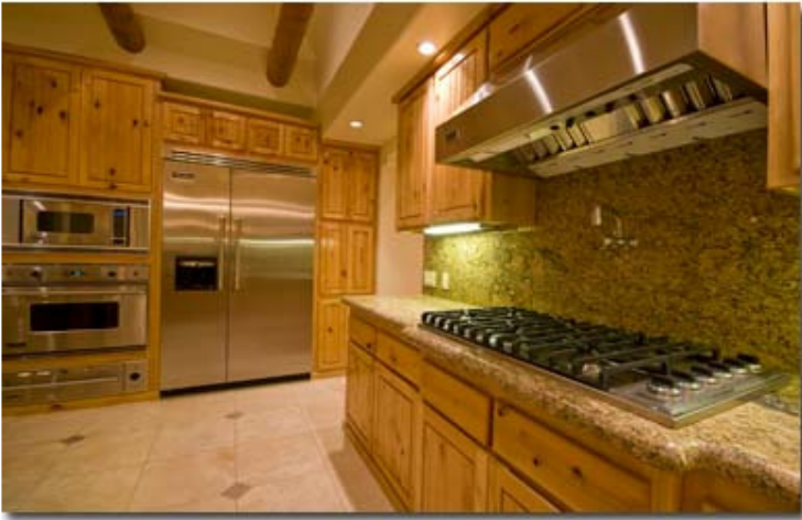
A chef is on staff at The Bridge Home to provide meals for residents.