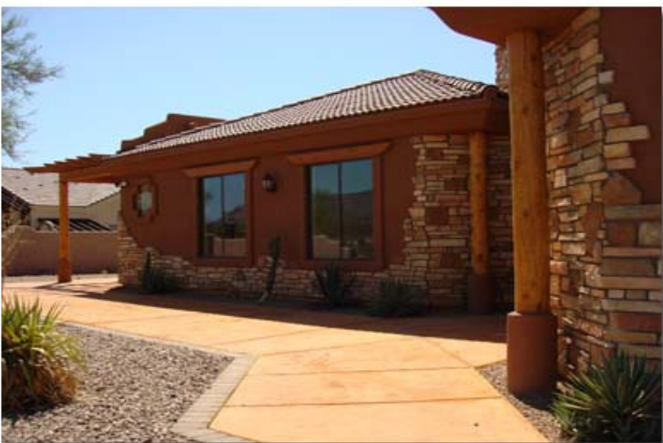
The at-grade front walk.

The monthly room rate is $4,000 per person, plus the cost of care. Three levels of care are offered — supervisory care for $800 a month; personal care for $1,300; and directive care, the most comprehensive care, for $1,800 a month.