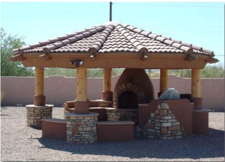
The custom-built gazebo features automatic misting to make the residents more comfortable in the Arizona heat.