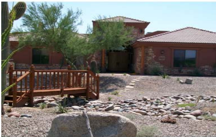
The footbridge in the front yard was the inspiration for the assisted living home's name.

The solution they decided upon was to transform the luxury homes into the Crismon Peaks , a high-end assisted and independent living community that includes a facility for people with Alzheimer's.