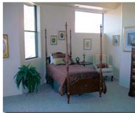
A single-occupancy residential suite.

The Bridge Home also is equipped with air, water and laundry purification technology so that chlorine and other chemicals never enter the residents' air, water, clothing or bedding.