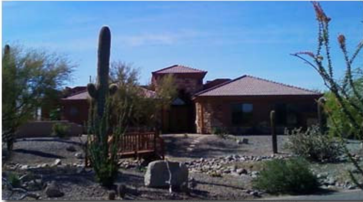
The Bridge Home is now an assisted living facility for residents with Alzheimer's or dementia. It was originally built as a four-bedroom, luxury home.